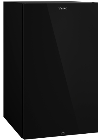
Underbench Wine Cabinets VWS830FCB, VWS830FAS