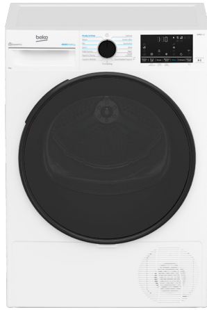
BDPB803SW 8kg Heat Pump