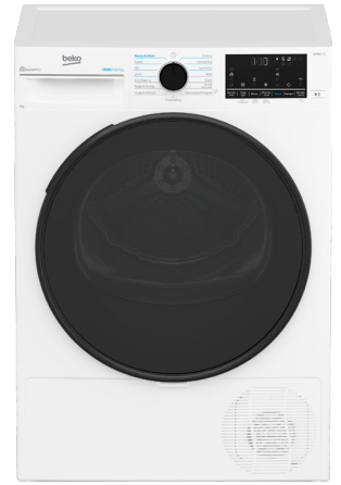
BDPB903SW 9kg Heat Pump