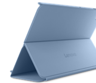
Lenovo Folio Case for Lenovo Tab