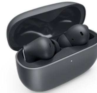
Lenovo TWS Earbuds (X9 Edition)-NA Version