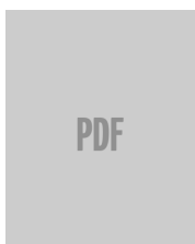
↓ Filter performance (PDF)