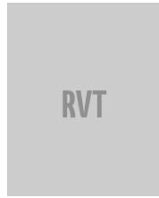
↓ Revit Virtual Showroom (RVT)