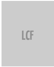
↓ ArchiCAD Swift Globals Library (LCF)