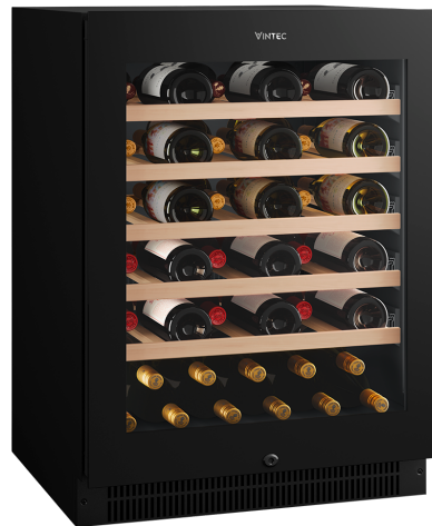
Underbench Wine Cabinets and Beverage Centre VWS820SCB, VWD820SCB, VBS820SCB